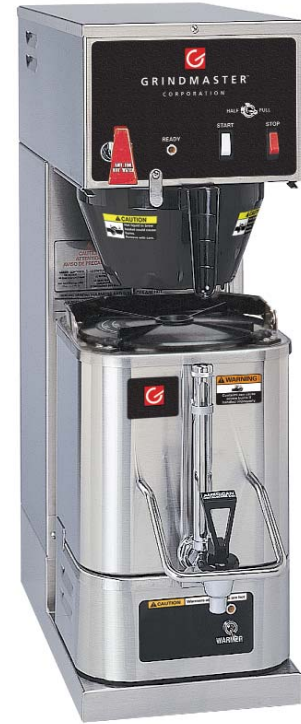
Model RAPS200 Shuttle®/Airpot Brewer

The P200 Shuttle® Brewer consistently delivers perfect coffee. Grindmaster's exclusive air gap insulated Shuttle® maintains the freshness and taste that your customers expect and allows you to transport and serve your coffee safely and easily.