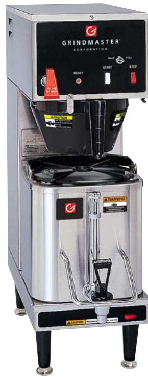
Model P200 Shuttle® Brewer