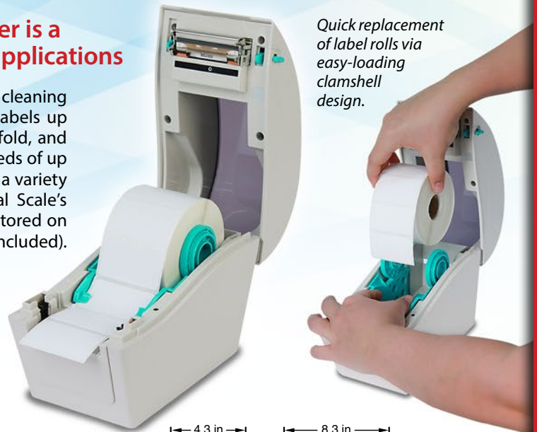
Quick replacement of label rolls via easy-loading clamshell design.