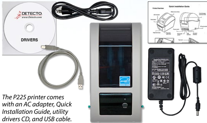
The P225 printer comes with an AC adapter, Quick Installation Guide, utility drivers CD, and USB cable.

The P225's clamshell design provides easy access to media for cleaning and installation. This printer is capable of printing a variety of labels up to 2-inches wide including continuous, die-cut, black mark, fan-fold, and notched via the external label entrance chute. Labels print at speeds of up to 5 inches per second at 203 DPI. The P225 is capable of printing a variety of graphics and logos through the printer software or Cardinal Scale's nControl label software. Graphics, bar codes, and logos may be stored on the printer's microSD flash memory up to 4 GB (microSD card not included).