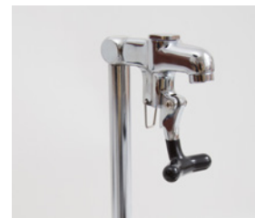
Optional Glass Filler Faucet