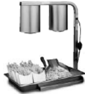
Model DW-1A Display Warmer