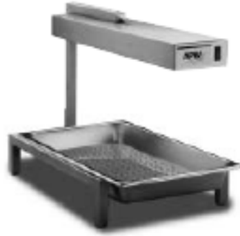
Model PD-1A Display Warmer