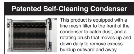
Patented Self-Cleaning Condenser

This product is equipped with a fine mesh filter to the front of the condenser to catch dust, and a rotating brush that moves up and down daily to remove excess buildup outward and away.