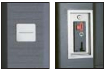
Room Card Coin-op

ICE DISPENSERS QFA-291 available with Push-For-Ice dispense actuator and water valve. QPA-160 and QPA-310 have Push-For-Ice, coin-op and room card ice dispense actuator options.