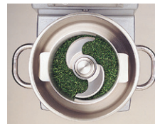
Shown with mini bowl assembly