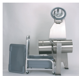
FOOD CART SHOWN WITH VCM