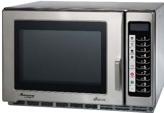
Model RFS12TS shown