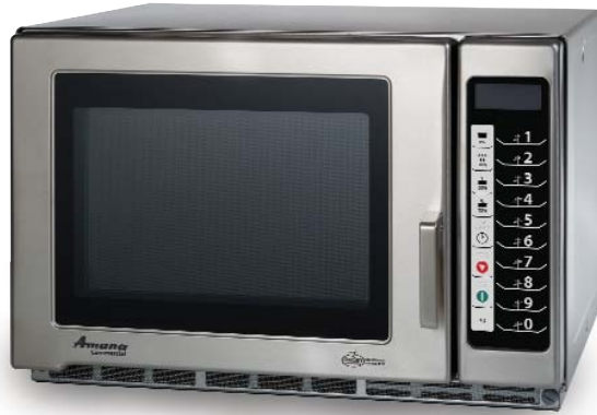
Model RFS18TS shown