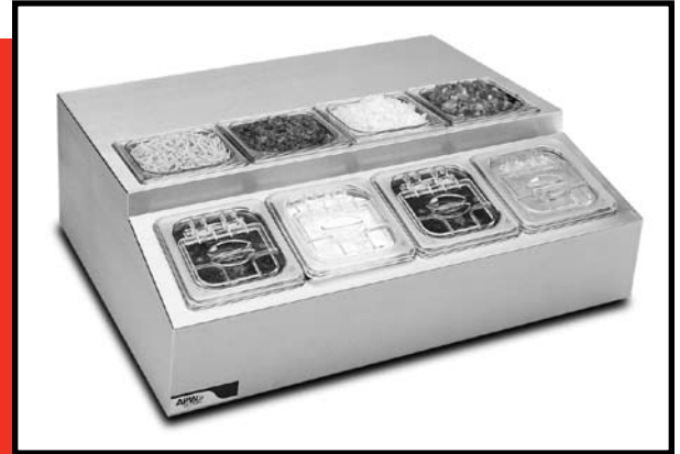
RTR-8 Refrigerated Topping Rail