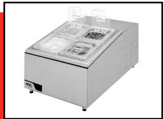
RTR-4 Refrigerated Topping Rail