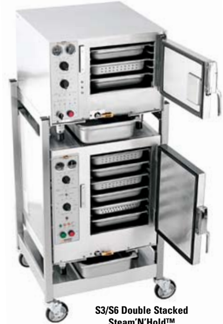
S3/S6 Double Stacked Steam'N'Hold™ Steam Cookers shown with double stack stand (with casters) and 4" drain pans