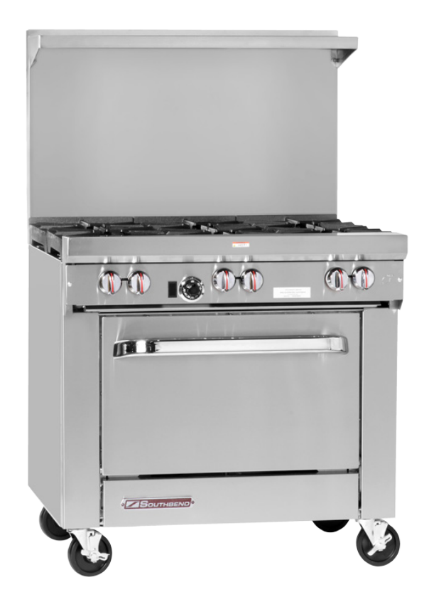
S36D (shown with optional casters)