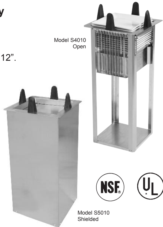
Model S4010 Open