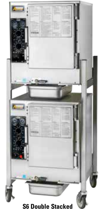
S6 Double Stacked Steam'N'Hold™ Steam Cookers shown with double stack stand (with casters) and 4" drain pans