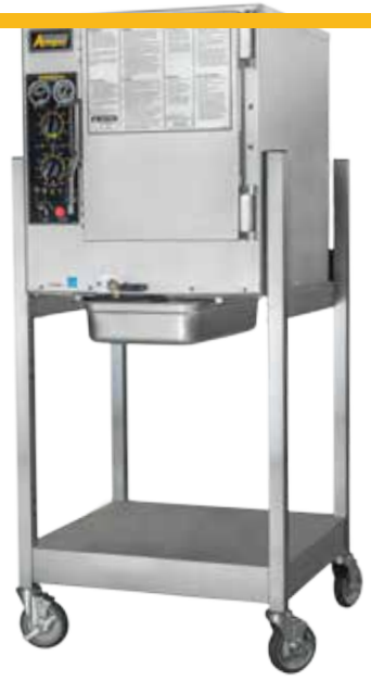
S6 Stand Mounted Steam'N'Hold™ Steam Cooker with optional 4″ drain pan