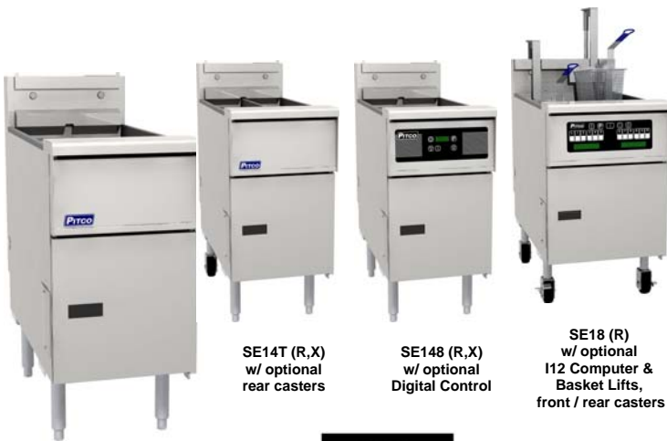
SE14 (R,X) w/ standard SSTC