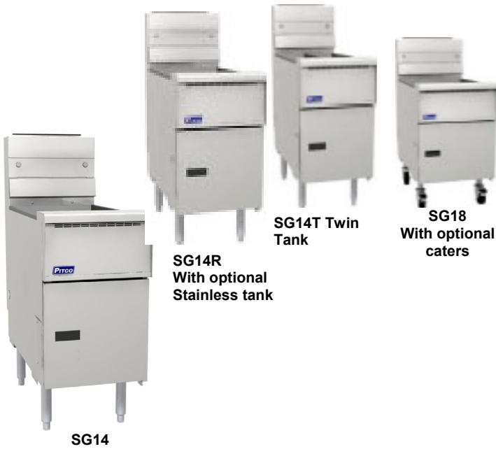
SG14R With optional Stainless tank