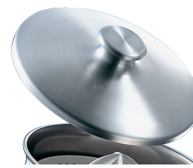
Optional lid for Apollo