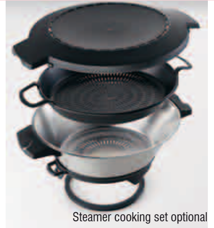
Steamer cooking set optional