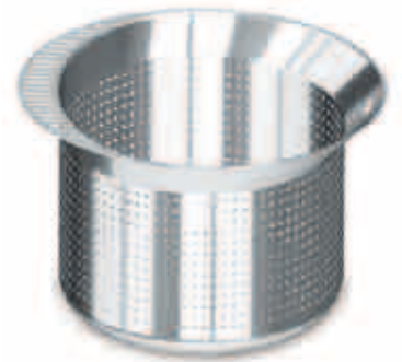
Pierced basket optional