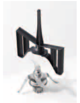
Butterfly mixer and knife hub