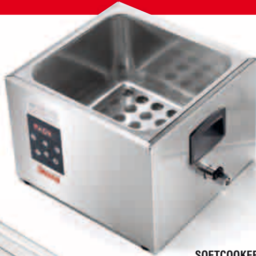
SOFTCOOKER SR 2/3 GN