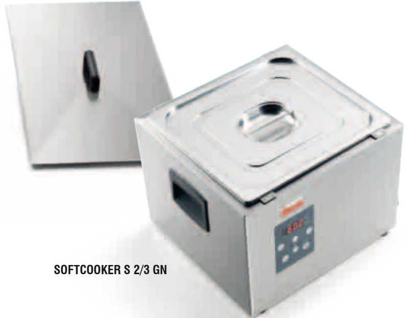
SOFTCOOKER S 2/3 GN