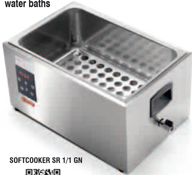
SOFTCOOKER SR 1/1 GN