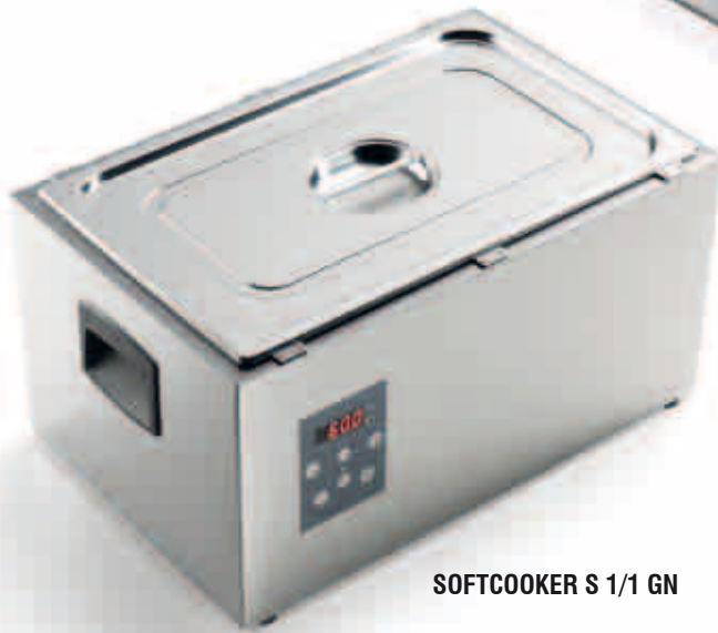
SOFTCOOKER S 1/1 GN