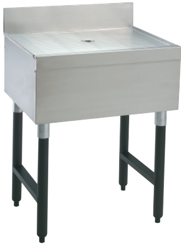
SLD Series 18" Wide Units