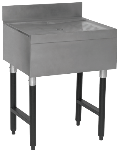
CRD Series 21" Wide Units