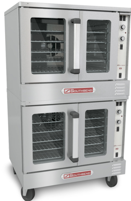
(SLGS/22SC shown with optional casters)