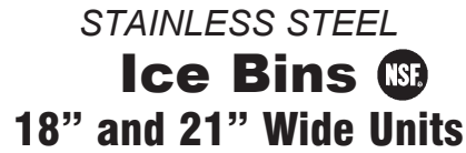
SLJ/SLI Series 18" Wide Units