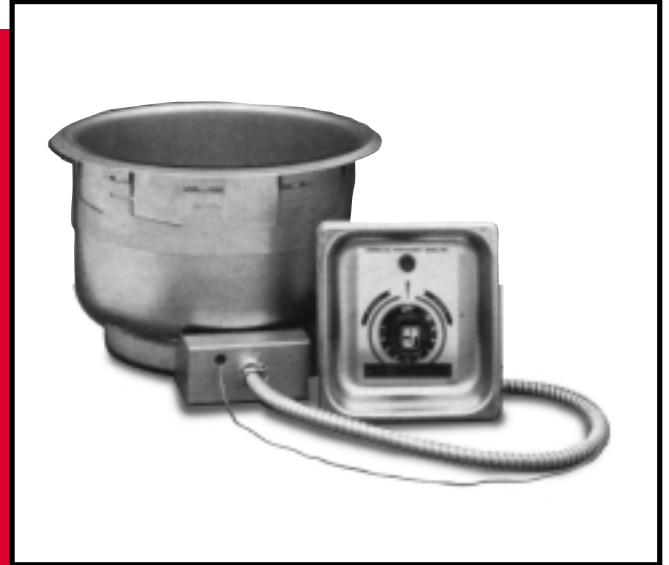
MODEL SM-50-11D UL HOT FOOD WELL