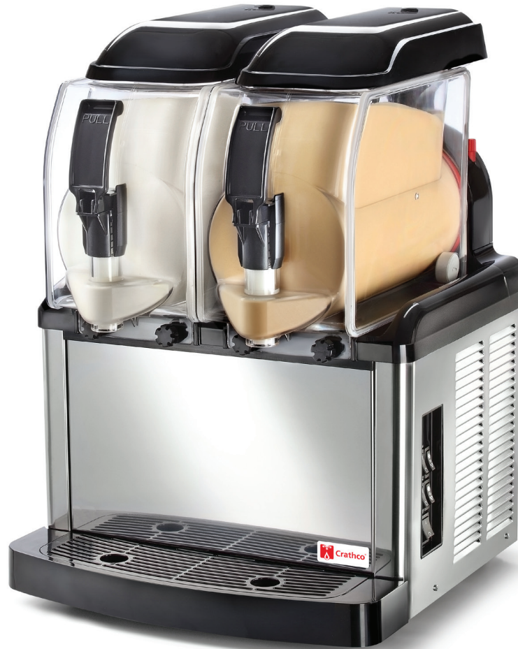
model SP 2