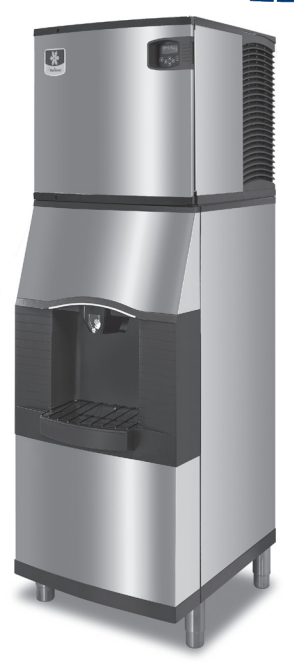
Indigo Series 522 Ice Machine SPA-160 Ice Dispenser

Ice only dispense, with coin-op and room card dispensing control options