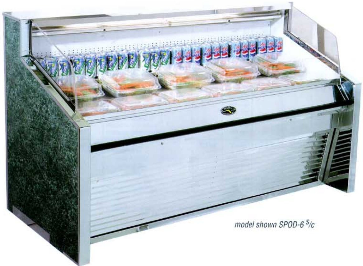
model shown SPOD-6 S/c