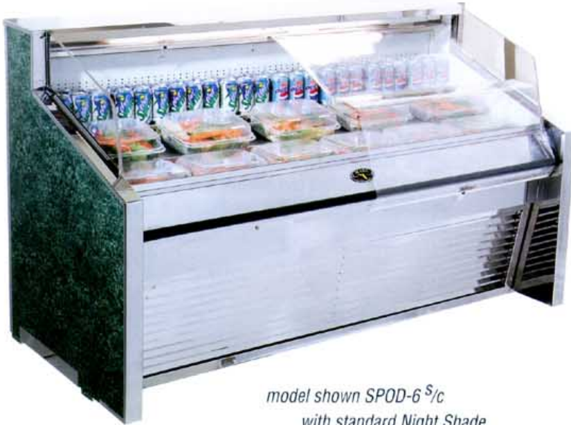
model shown SPOD-6 S/c with standard Night Shade