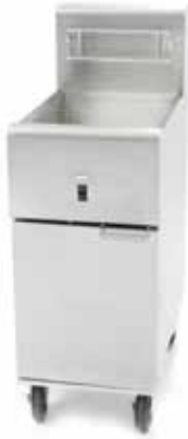
SR14E Shown with optional casters.