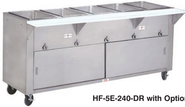
HF-5E-240-DR with Optional SU-25 Casters Shown