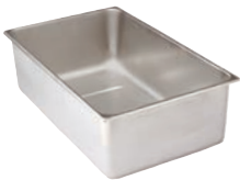
SP-A - Spillage Pan

Visit our website for additional Food Table Accessories