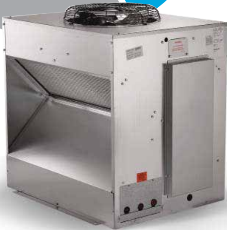
ECC Series Condensing Unit - Dedicated condensing unit for Prodigy Plus® Eclipse