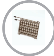
Clear Cube Evaporator Technology