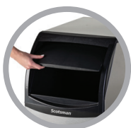
Ergonomic slide back door allows easy access to ice in the bin