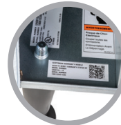
Unit specific QR code for quick access to service manuals, cleaning guides and warranty history