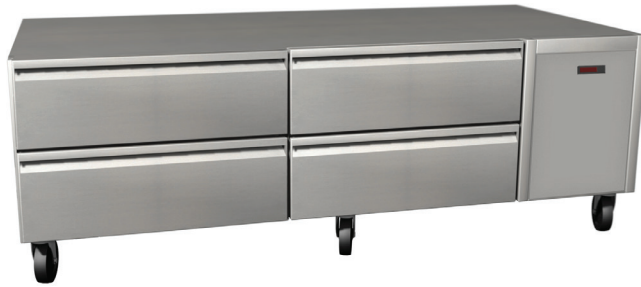
(Model 30072RSB with optional casters)