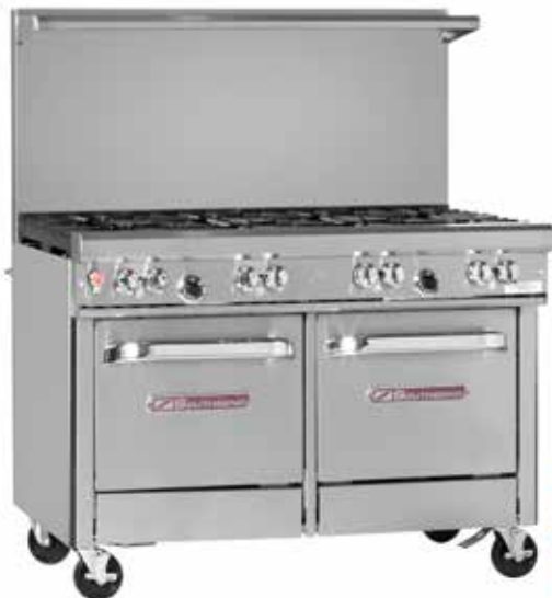
4481EE (shown with optional casters)

Configure your own custom spec sheet and model number at www.BuildMyRange.com. Refer to AutoQuotes for list pricing.