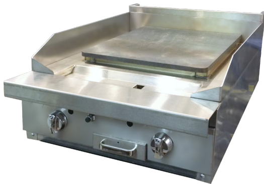
Model P24N-PP shown

** PLANCHA UNITS DO NOT ALLOW SPECIFIC TEMPERATURE OPERATION **