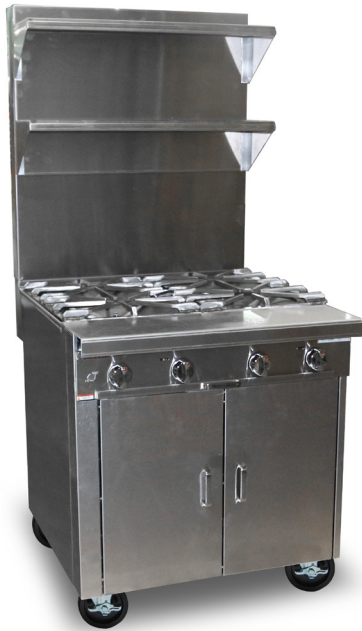
Model P32A-XX with optional 36" flue riser, optional removable cast iron grate tops and optional casters