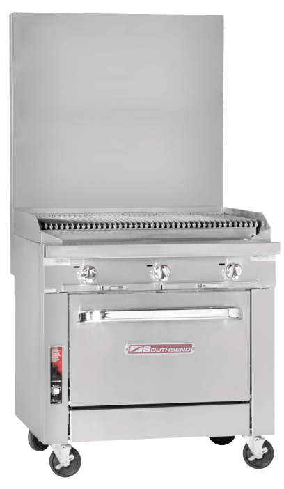
P36D-CCC w/ optional casters and flue riser.