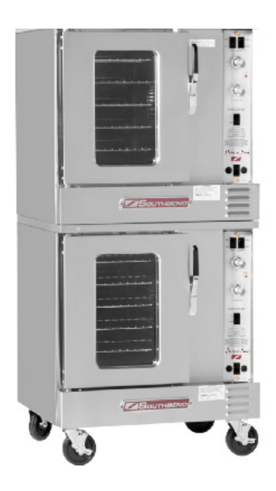
PCHE15S/S shown with optional casters