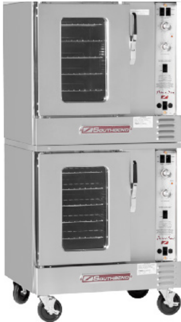
PCHE15S/S shown with optional casters