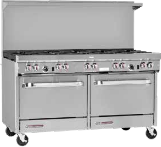
S60DD (shown with optional casters)