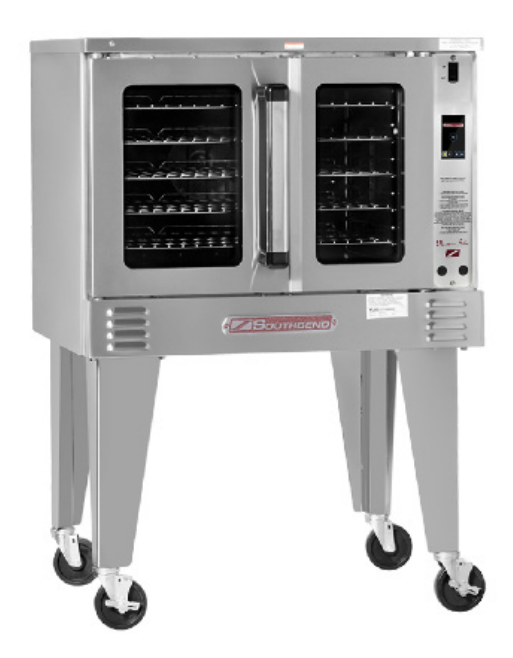
PCE75S/T shown with optional casters

STANDARD TOUCHSCREEN □ PCE75S/S □ PCE75S/T □ PCE11S/S □ PCE11S/T