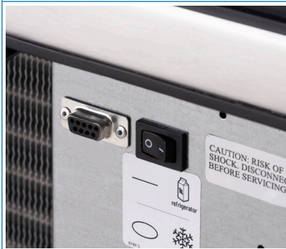
Refrigerator/Freezer Toggle Switch located Behind the Grill