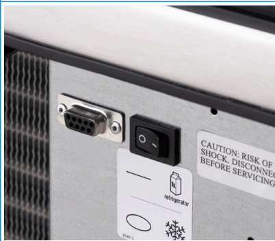
Refrigerator/Freezer Toggle Switch located Behind the Grill