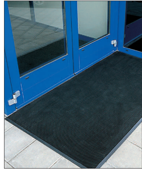
Application Requirements: Keeps moisture and debris outside, withstands elements