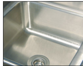
Deep Drawn Bowls are Seamless and Drawn out of a Single Sheet of Steel