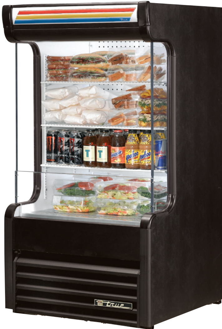
Shown with optional exterior.