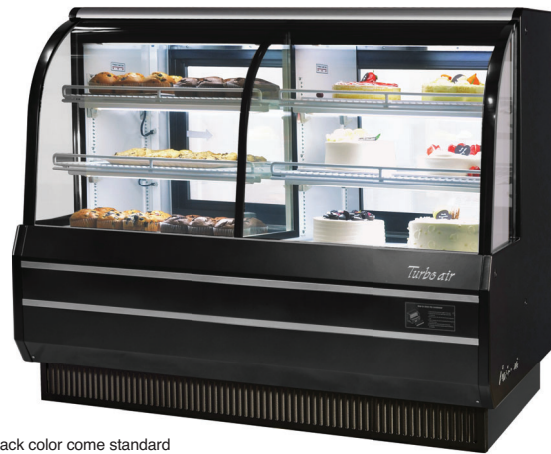
* White and black color come standard