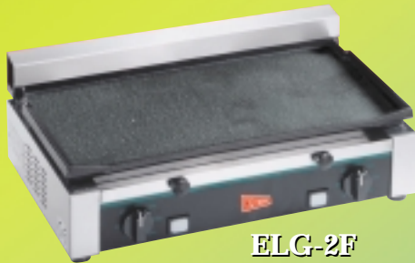
ELG-2F Double Flat Grill