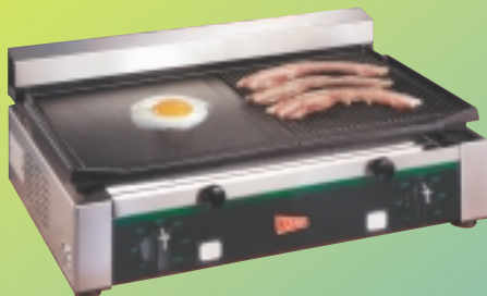
ELG-2F/G Double Grill 1/2 Flat 1/2 Grooved

Whether you need to cook burgers, hot dogs, steaks, chicken, fish or vegetables, you can do it safe and easily with the new light weight electric grills from Cecilware. Each grill is hand crafted and designed to add versatility to your restaurant. Requires very little counter space and heats up in seconds.