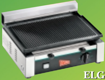
ELG-1G Single Grooved Grill