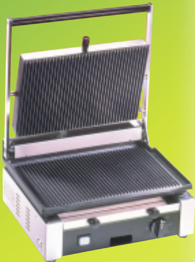
Single with Grooved Surface