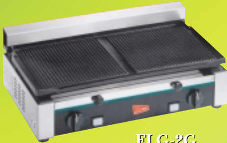
ELG-2G Double Grooved Grill