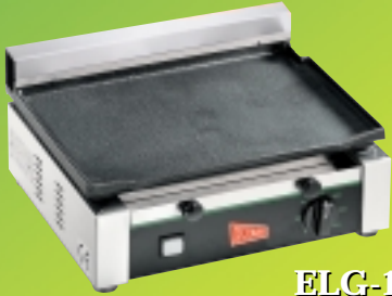
ELG-1F Single Flat Grill