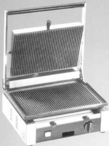
Single with Grooved Surface

Perfect For Grilling Steak & Chicken Sandwiches Burgers & Hot Dogs Fish & More!