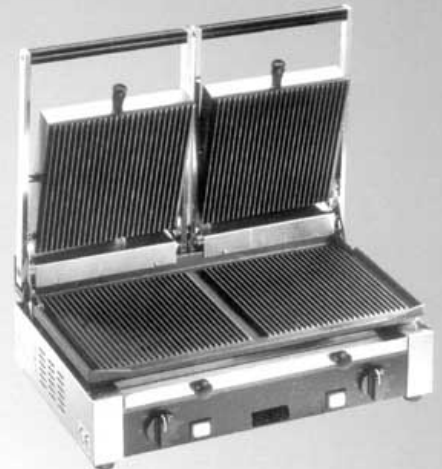
Double with Grooved Surface

Perfect For Grilling Steak & Chicken Sandwiches Burgers & Hot Dogs Fish & More!