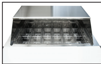
Removable cover with slide back lid

This product is equipped with a fine mesh filter to the front of the condenser to catch dust, and a rotating brush that moves up and down daily to remove excess buildup outward and away.